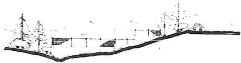
TREE SHRUB BOUNDARY, LUP HOUSE / SHOWER, PLANT PLAZA, TREE SHRUB AREA, RUN